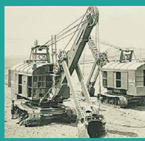
apan's first electric shovel in 1930

In 1930, Kobe Steel manufactured Japan's first domestically produced electric shovel, followed by Japan's first hydraulic excavator in 1963. Since then, the KOBELCO brand has been associated with groundbreaking construction machinery ranging from civil engineering equipment to machines used in recycling operations.